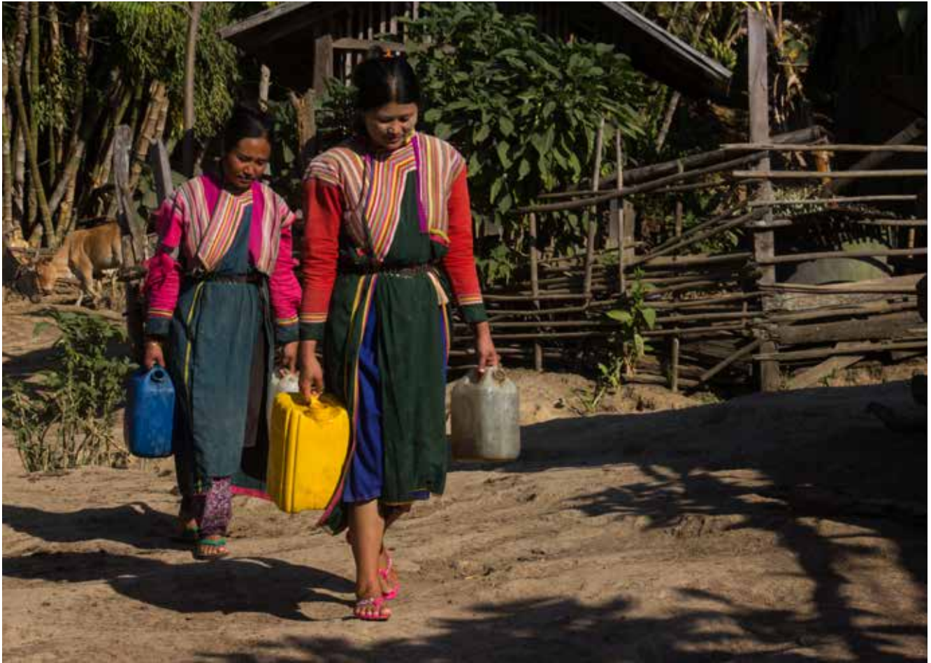
Two women fetch water from a nearby spring in Shan state, Myanmar.

Research conducted by Alert's partner the West Asia-North Africa (WANA) Institute in Jordan reveals the distinct ways that identities intersect with the politics of marginalisation and exclusion, in terms of climate-related impacts. In situations of water shortages, women face additional layers of burden, particularly Palestinian and Syrian refugees and female-headed households. These women are at risk of increased exposure to illness and harassment during their water collection responsibilities and at higher risk of domestic violence in the home. 22 In Lebanon , a similar trend places Syrian refugee women in precarious situations when they are employed in the agricultural sector, for collection or retail sale of agricultural products. Despite a lack of hard data on this grey economy, it appears that salary differences are stark. Gender roles can also differ in the context of ecological stress, for example, women have shown agency by stepping in for the ecological protection of forests, in the absence of state action on the issue. 23