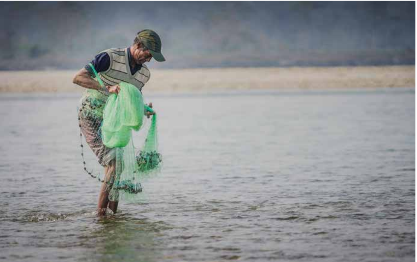
A member of the indigenous gold panning and fishing community in Bardiya district, Nepal prepares to cast his net at the Karnali river. He is one among many in the downstream community impacted by climate change.

Alert uses a rights-based research approach to equip civil society groups and local farmers with evidence on the shortcomings in public water policies and the subsequent impact these have on vulnerable people. This empowers civil society to participate meaningfully in climate-related discussions and contribute usefully to the development of state-level initiatives to reduce disparities, ensure right of access to water in marginalised regions and advocate for sustainable alternatives to the current methods which deplete resources. 13